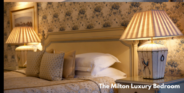
The Milton Luxury Bedroom