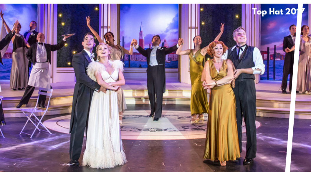
Top Hat 2017