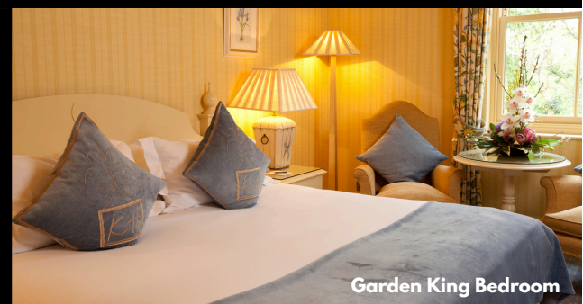
Garden King Bedroom

With prices starting from £379 based on double occupancy. Call our Theatre Break line on 01858 881805 for more details about group theatre breaks.