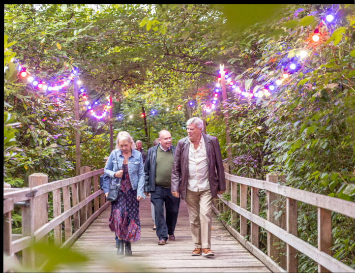
Singin' in the Rain 2024